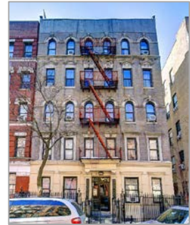
452 West 164th Street