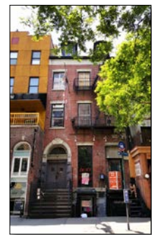
4 St. Marks Place

Please contact your financial advisor or Castellan Investor Relations at ir@castellanre.com if you would like to review the Private Placement Memorandums for these opportunities.